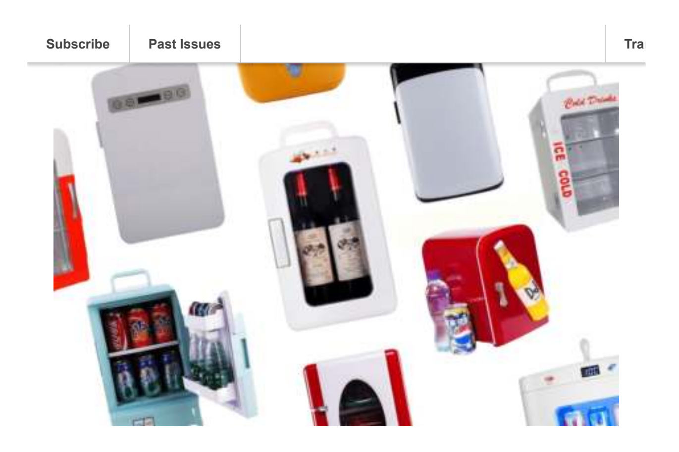
5. Top 10 Events PLUS Promotional Gift Ideas for September!