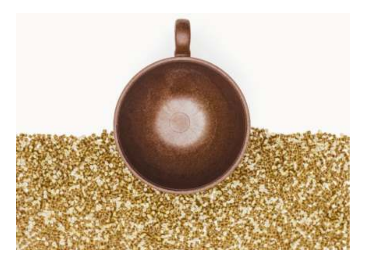
2. AFTERLIFE: Recycled Tennis Ball Products Exhibition in Hong Kongl

1. Factory Visit: Manufacturing Products from Coffee Bean Material