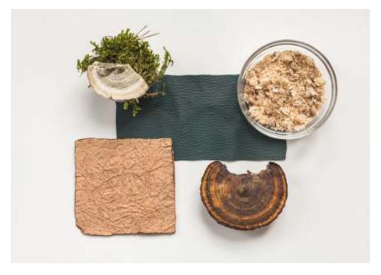
Top 5 Magazine Articles from August

Bio-Based Leather to Replace Genuine Leather: Why Should We Switch?