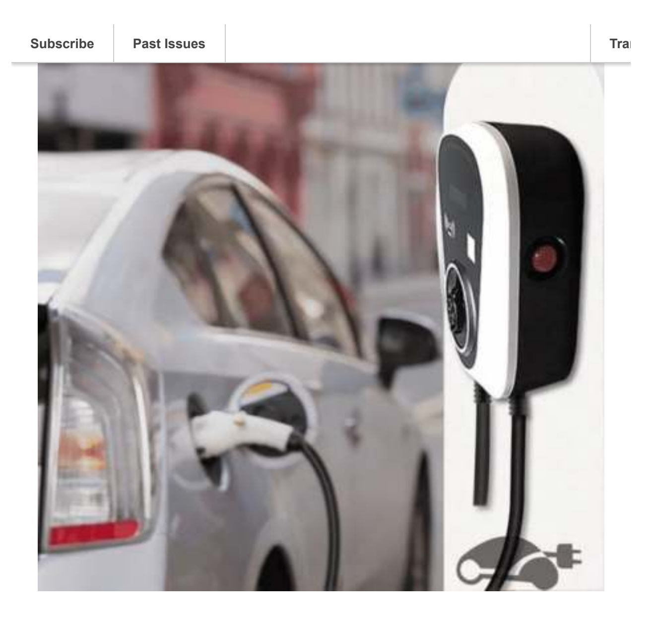
4. Branded Mini Fridge Ideas: Top 5 Branding Advantages to Leverage On